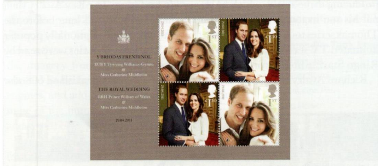
Facing page: First Day Cover, available until 19 May. Above: postmark available from Talents House Above left: the Souvenir Cover includes a fully illustrated booklet. Left: the Presentation Pack tells the story of the Royal romance

Y Briodas Frenhinol The Royal Wedding Et Uchelder Brenhinol Y Tywysog William o Gyrene & Miss Catherine Middleton This Royal Highness Prince William of Wales & Miss Catherine Middleton